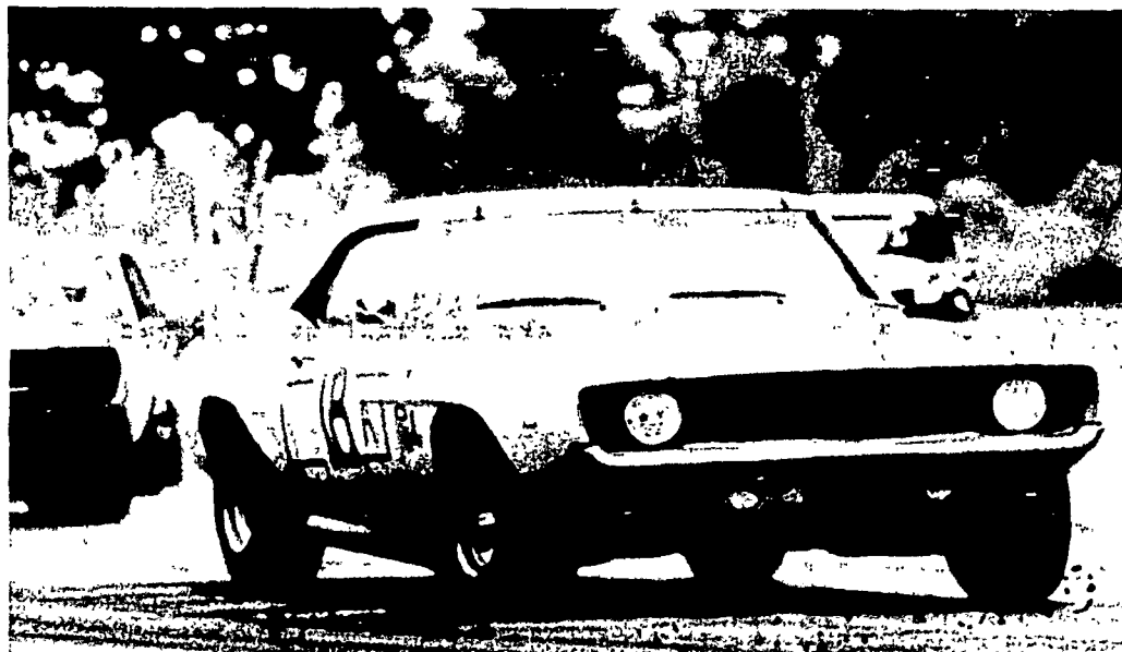
★ Racing at Black Hawk Farms, South Beloit, Ill. ★